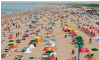
Zomer in Nederland

Sender: New Zealand Netherlands Society (Wellington) Inc. P.O. Box 30060 Lower Hutt 5040 New Zealand